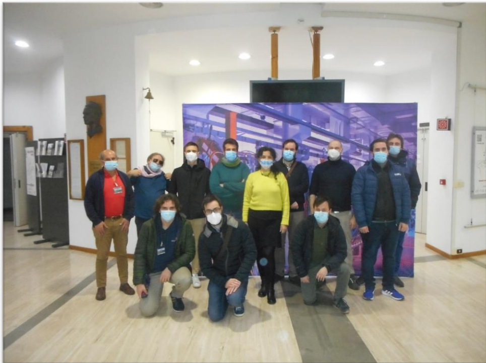
The participants of the "Mini-Symposium Quantum Boundaries: Gravity-Related Collapse Models", Frascati (IT), December 2022.