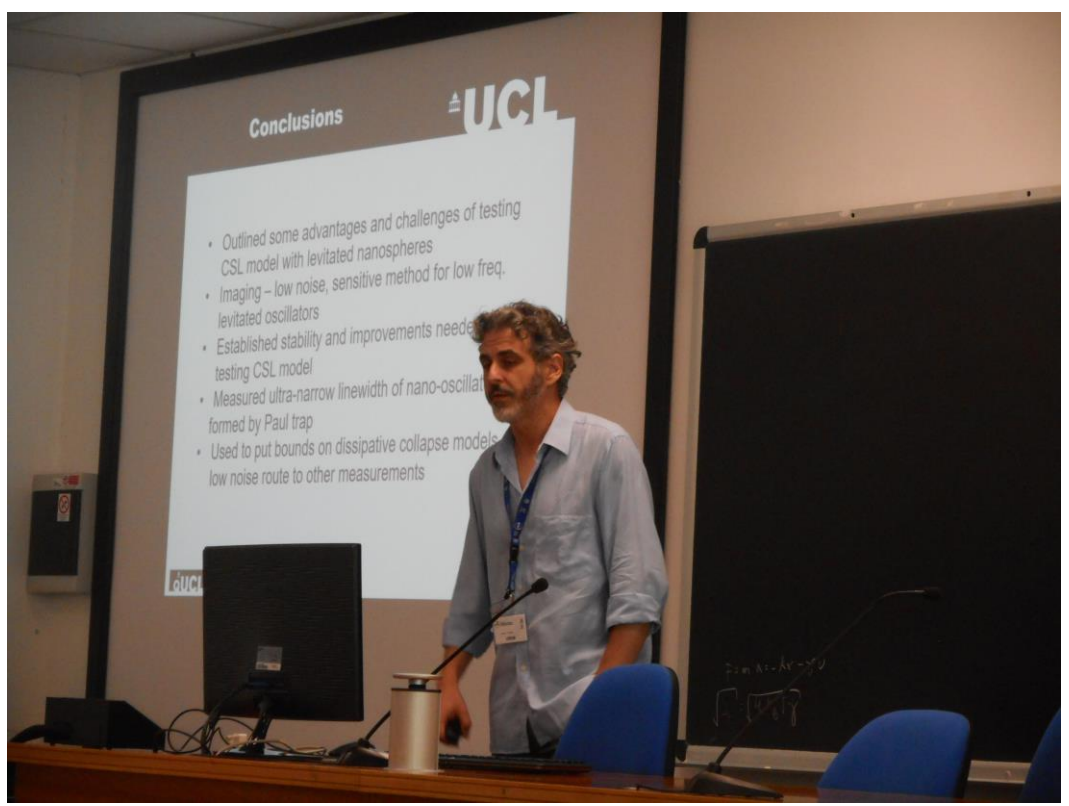
6. A TEQ junior member wraps up his talk on ""An ultra-narrow line width levitated nano-oscillator for testing dissipative wavefunction collapse"