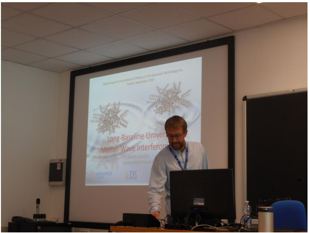
5. External expert gives a talk on "Long-baseline Universal Matter Wave Interferometry"