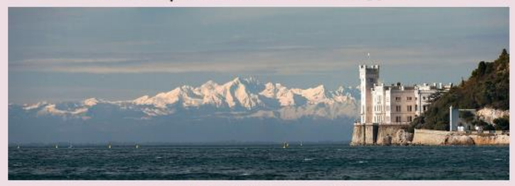
Trieste - 16-19 September, 2019 Adriatico Guesthouse ICTP

TEQ - Testing the Large scale Limit of Quantum Mechanics, is a EU H2020 FET project, which will explore the macroscopic limit of quantum theory, with the specific goal of answering the question: does quantum coherence survive when the mass/complexity of a system increases, or does it break down as predicted by alternative formulations? Within the framework of TEQ, the workshop Redefining the foundations of physics in the quantum technology era will explore the state of the art – both theoretically and experimentally – of our understanding of quantum theory and discuss the new directions of research.