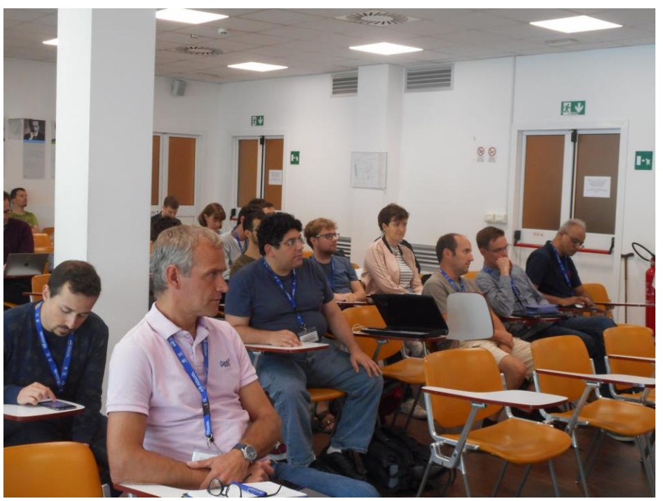
4. Participants at the TEQ Workshop

The workshop was attended by a total of 44 participants. The speakers were a total of 22, being 8 junior members of the TEQ Consortium and 14 external experts.